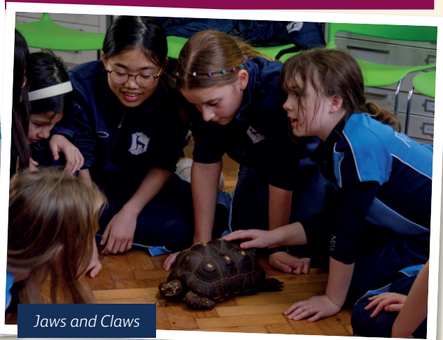
Jaws and Claws