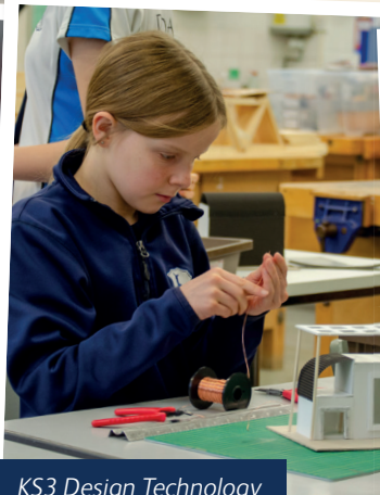
KS3 Design Technology