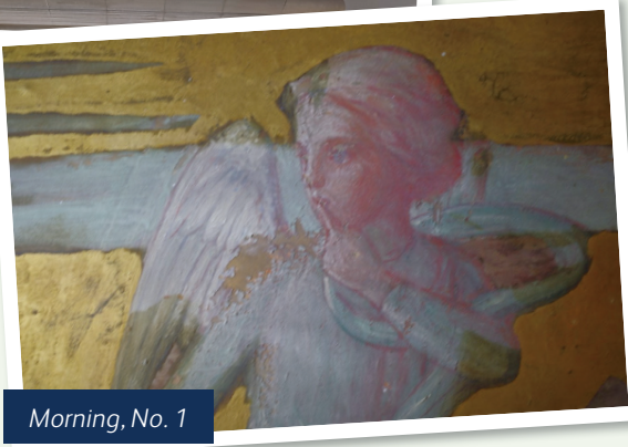
Morning, No. 1