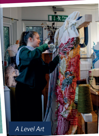
A Level Art