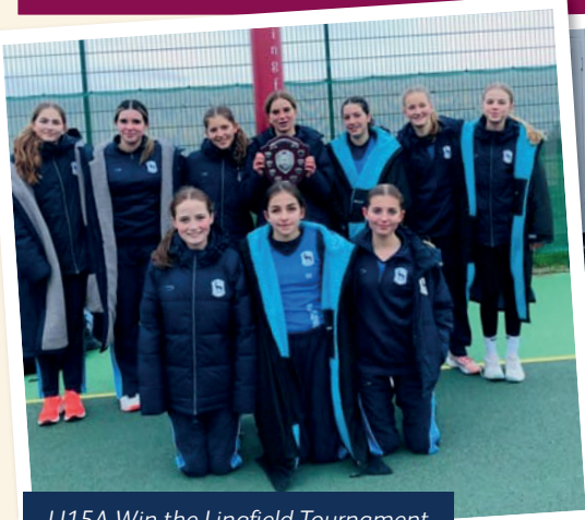
U15A Win the Lingfield Tournament