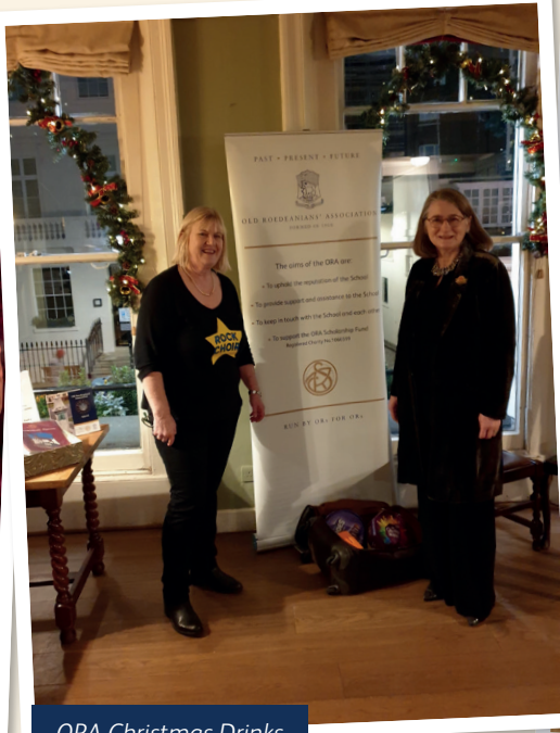
ORA Christmas Drinks