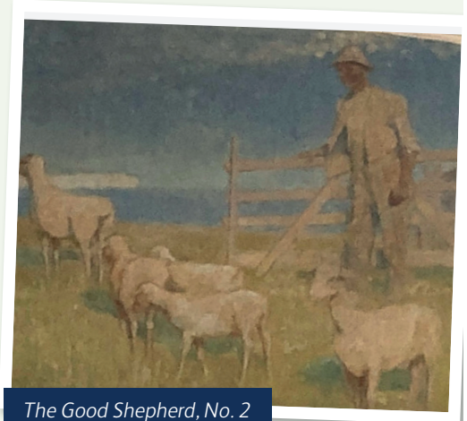
The Good Shepherd, No. 2

The murals in Nos 1 & 2 are deteriorating rapidly. In 2022 the ORA funded emergency, temporary repairs to the frieze in No 1.