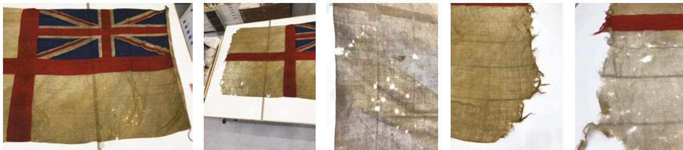
Current condition of HMS Collingwood (No.1)