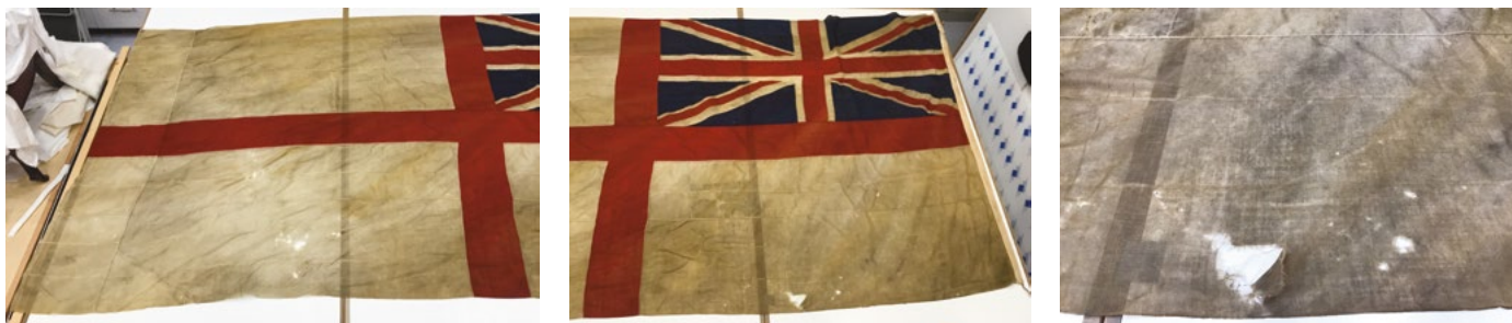
Current condition of HMS Canterbury (No.3)